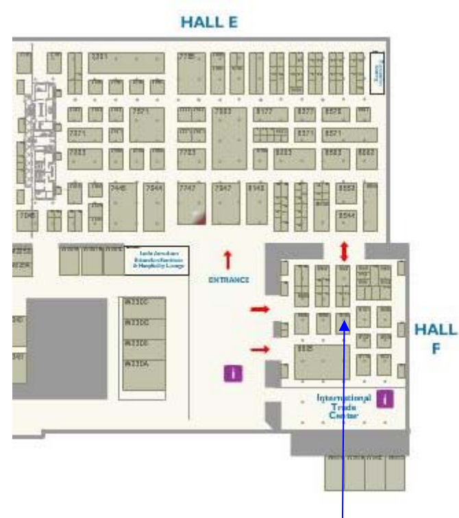
HALL F : BOOTH 9035 HYROBOTICS CORP

NEXIA-100S, HIT-100S TOPIV 750XC, TOPIV 750XC ( 4 ROBOTS ON FIXTURE )