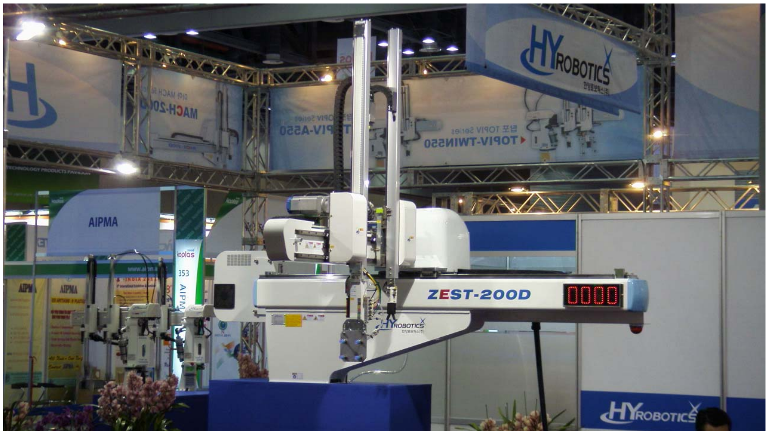
NEW ! ZEST SERIES ROBOT IN HYROBOTICS BOOTH : HIGH SPEED 3 AXIS SERVO ROBOT