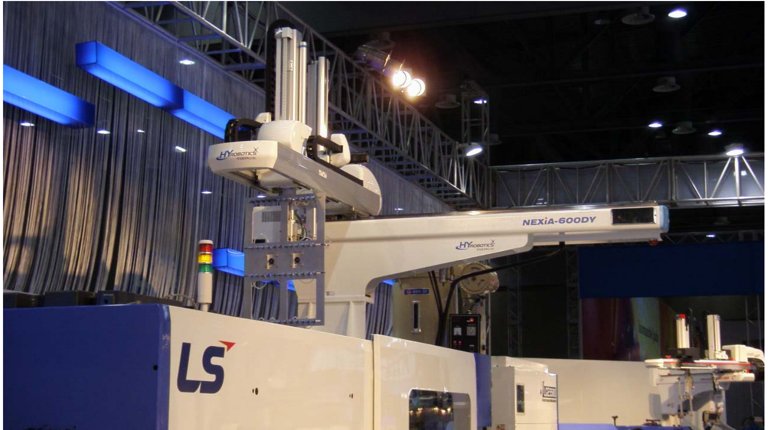
NEXIA SERIES ROBOT ON LS MOLDING MACHINES ( LS BOOTH ) 600 TONS