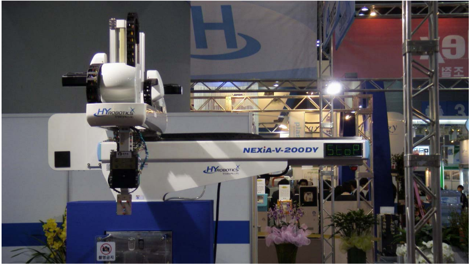
NEXIA SERIES ROBOT ON STAND ( HYROBOTICS BOOTH )