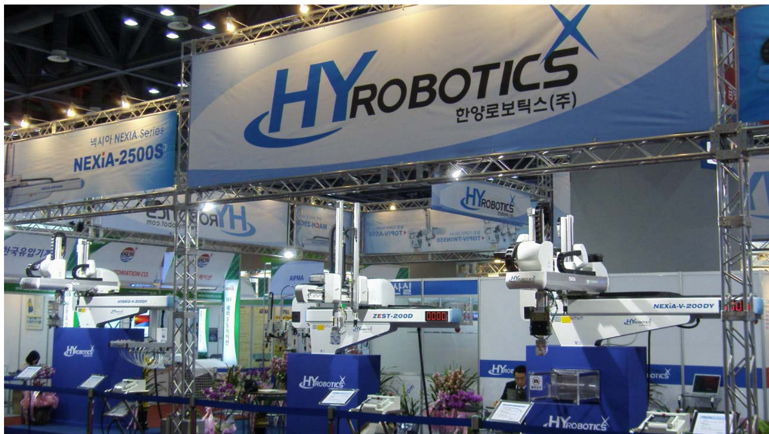
HYROBOTICS BOOTH WITH NEXIA, HYBRID, ZEST, TOPIV ROBOTS