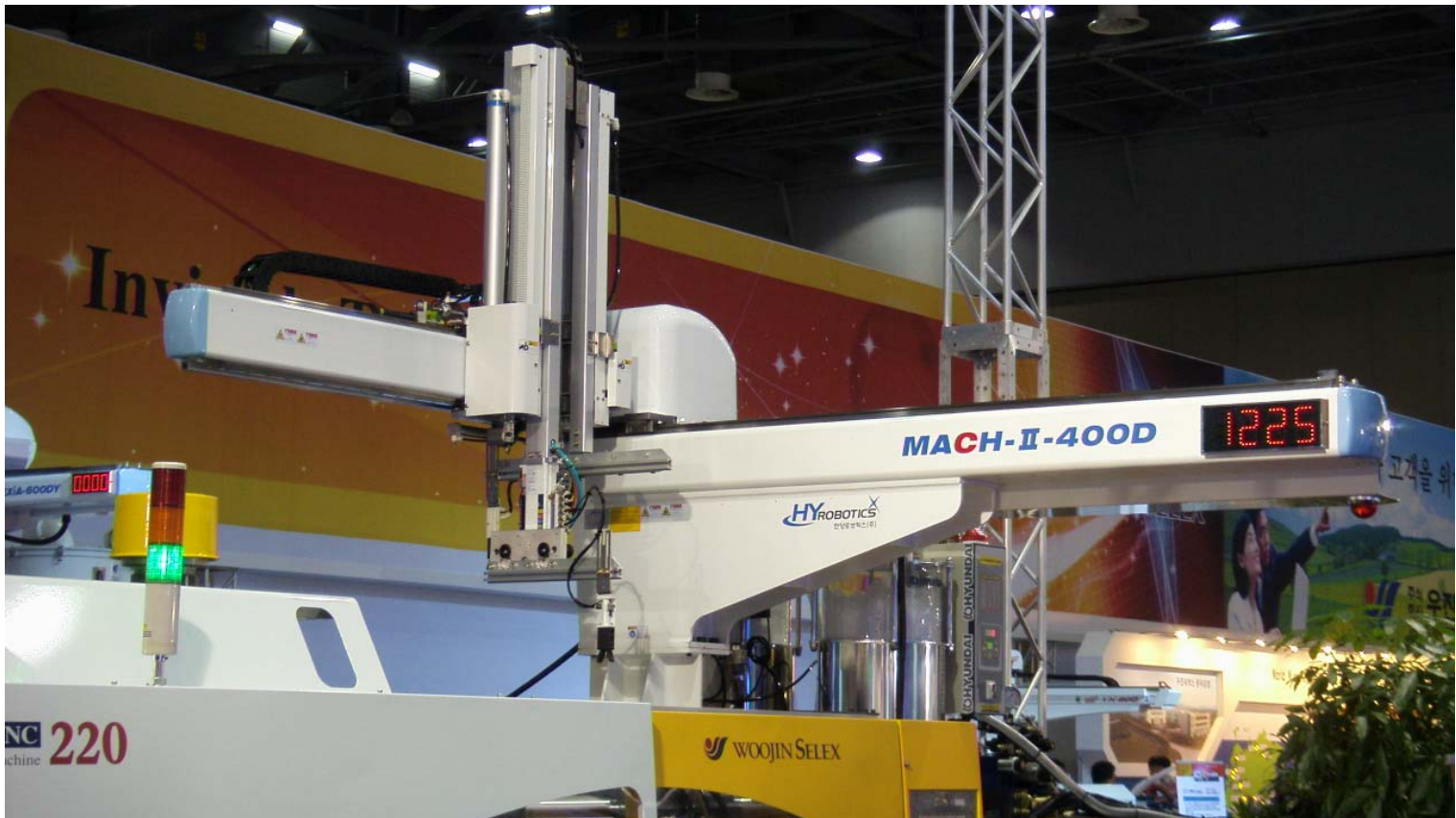
NEW ! MACH III SERIES ROBOT ON WOOJIN MACHINES ( WOOJIN BOOTH ) : 220 TONS