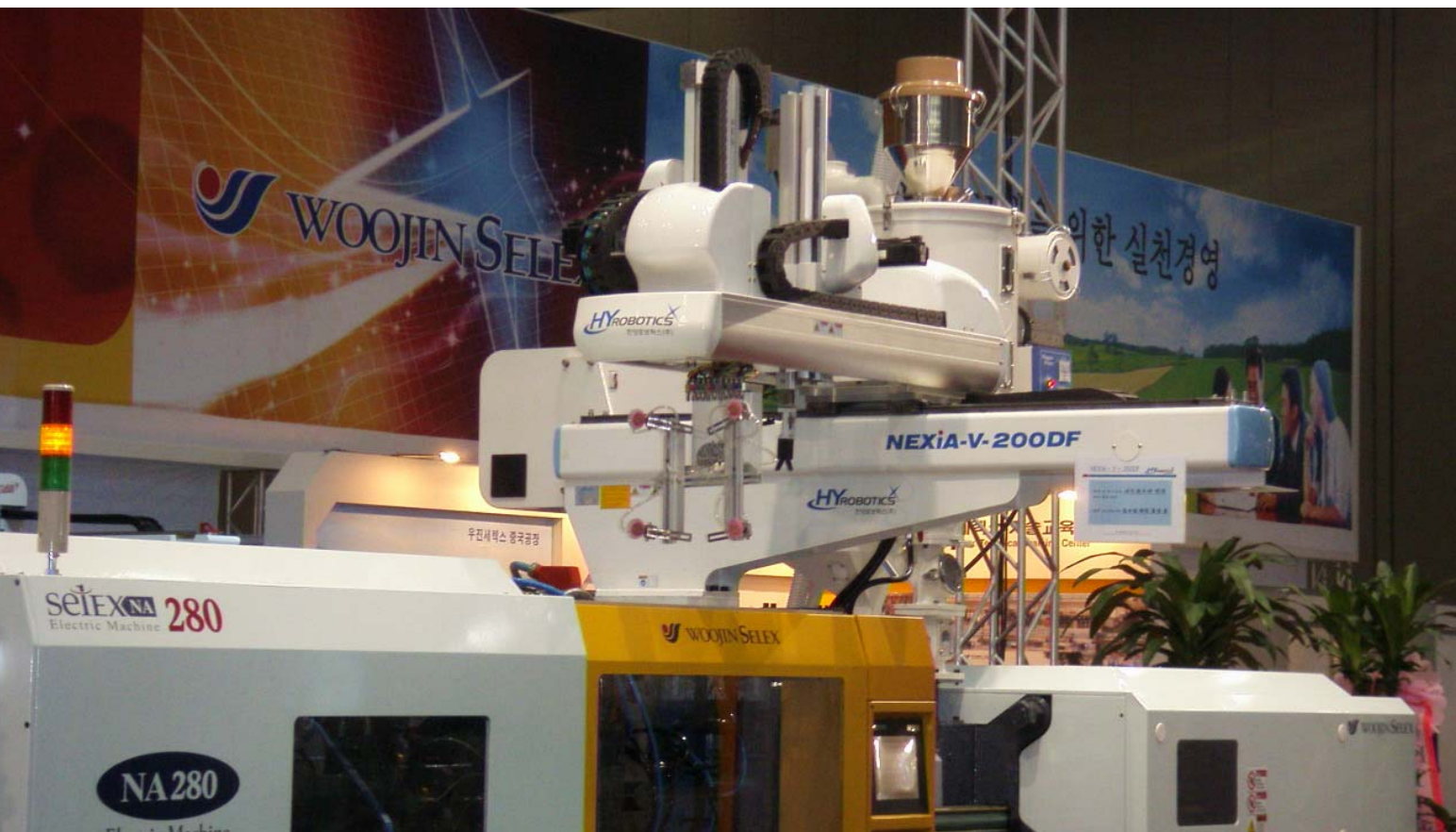
NEXIA SERIES ROBOT ON WOJIN MACHINES ( WOJIN BOOTH ) : 280 TONS