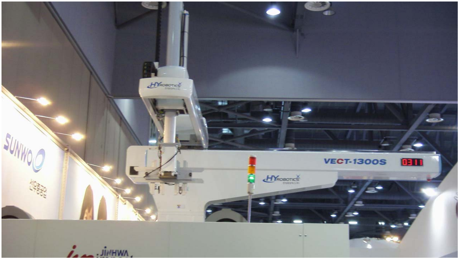
VECT SERIES ROBOT ON JINHWA MOLDING MACHINES ( JINHWA BOOTH ) 1300 TONS