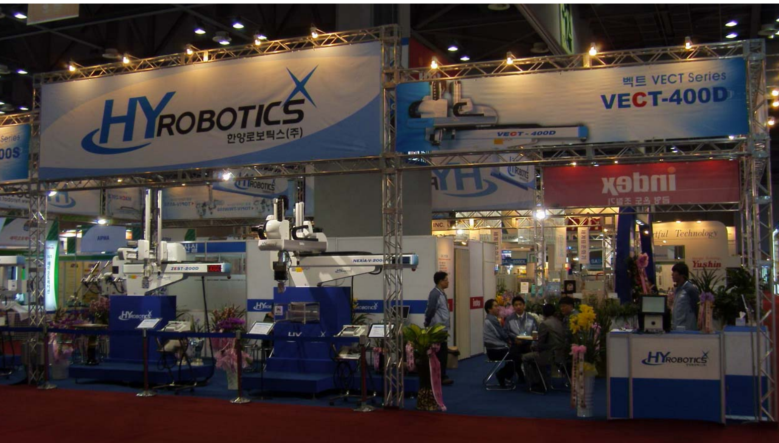
HYROBOTICS BOOTH WITH NEXIA, HYBRID, ZEST, TOPIV ROBOTS, PEOPLE